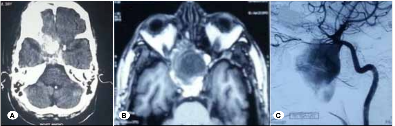
Figure 1: A) Post digital subtraction angiography head showing a contrast-enhancing lesion in the suprasellar region with erosion of surrounding bone, B) T2 WI MRI axial sections showing hypointense lesion in suprasellar region, C) IADSA AP and lateral view on right ICA injection showing multilobed small neck pseudoaneurysm arising from the right paraophthalmic and cavernous ICA junction and projecting into sphenoidal sinus.