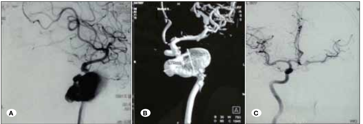
Figure 2: A) IADSA left ICA injection lateral view showing multilobulated left ICA lateral segment dissecting pseudoaneurysm measuring 3.7 x 2 x 2 cm with neck of size 1.3 cm, projecting into sphenoid sinus, B) IADSA 3 D reconstruction images showing the left ICA pseudoaneurysm, C) IADSA AP view on right ICA injection with left ICA compression showing good cross flow.