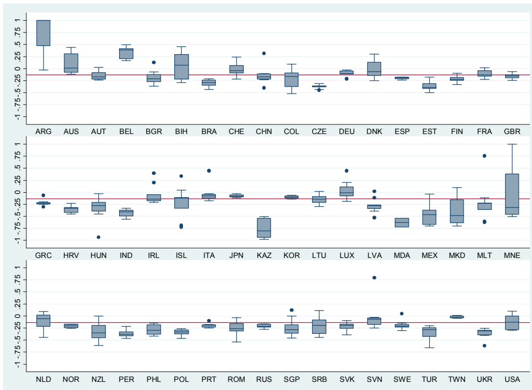
Figure 1 Tax base allocation over time: apportionment by total assets

Next we discuss the results for the different apportionment factors. In order to use as much of the information as possible, we first simulate the tax revenue effect for each of the apportionment factors separately. The detailed results of these simulations can be found in Appendix Tables A1-A6.