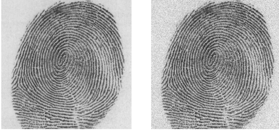
FIG. 2. Original image on left, noisy image on right.