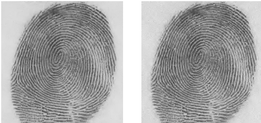
FIG. 3. Translation-invariant wavelet denoising on left, t = 0.0711878 ; wavelet shrinkage with “critical” shrinkage on right.

the shrinkage parameters reported in [2] must be divided by 512, the square root of the number of pixels, to compare to this paper.) It would seem, heuristically, that the process of averaging over all pixel translates of the image after wavelet shrinkage would provide some measure of smoothing beyond that effected by the wavelet shrinkage itself, so the smaller optimal shrinkage parameter in this paper does not surprise us; on the other hand, we can offer no argument to quantify this effect.