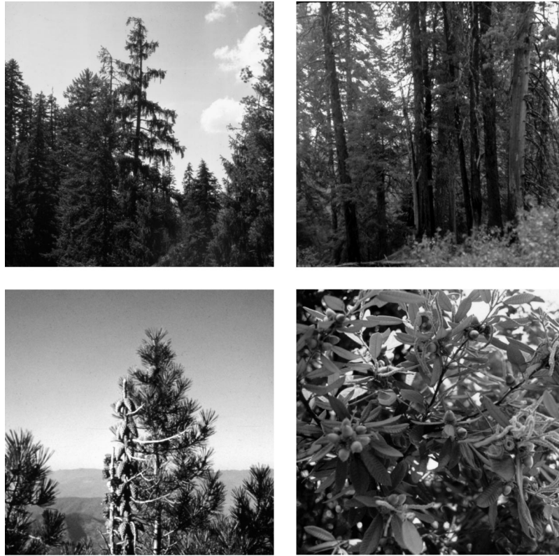
PLATE 1. In the Miller Lake drainage in southwestern Oregon (Latitude 42°03' N, Longitude 123°13' W), tree species richness peaks with more than a dozen conifers including Picea breweriana S. Wats. (upper left), Cupressus bakerii Jeps. (upper right), Pinus attenuata Lem. (lower left) and a number of endemic shrubs, such as Quercus sadleriana R.Br. (detail, lower right). Other conifers present in the drainage include: Abies concolor (Gord. & Glend.) Lindl., Abies magnifica Murr. v. shastensis Lemm., Chamaecyparis lawsoniana Parl., Juniperus sibirica Burgsd. Pinus lambertiana Dougl., Pinus monticola Dougl. ex D. Don, Pinus ponderosa Dougl., Pseudotsuga menziesii (Mirb.) Franco, Taxus brevifolia Nutt., and Tusuga mertensiana (Bong.) Sarg.