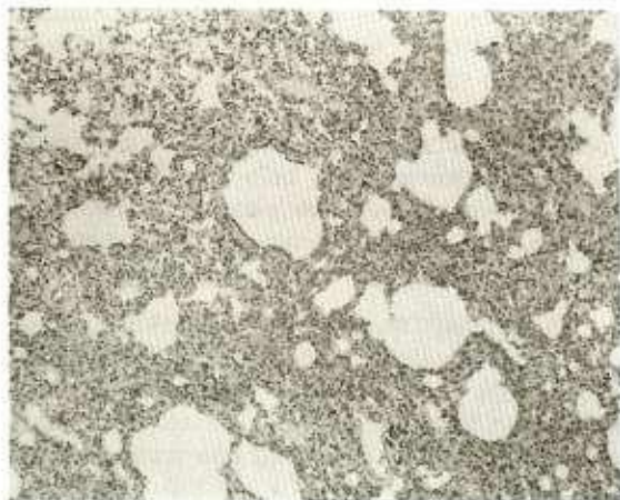
Fig. 1 — Cellular type: septal thickening by mononuclear cell infiltrate. HE X 100.