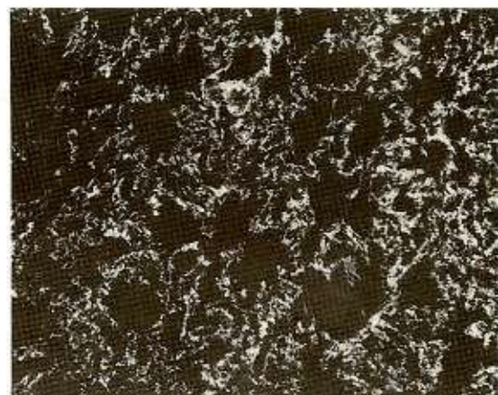
Fig. 4 — Lung tissue treated with Picro-sirius stain and observed under polarized light, showing septal thickening due to collagen fibers. X 100.

The alveolar lumen had neither edema or exudation.