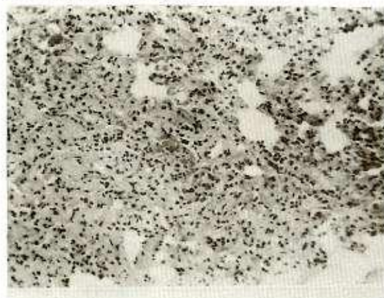
Fig. 2 — Cellular-fibrotic type: detail of the mononuclear cells infiltrate together with delicate bands of fibrous tissue within the septum. HE X 400.

3. "Fibrotic": bands of fibrous tissue thickening the intra-alveolar septum and involving large areas of the lung parenchyma were characteristic of this type. The alveolar lumen was preserved. Fibrosis was accompanied by discrete mononuclear cell infiltrate without alterations of capillaries and pneumocytes. Vicariant emphysema was related with the more fibrotic areas. Fibrosis, even thinner ones, could be demonstrated through the Picrosirius stain method when examined under polarized light (Figure 3 and 4).