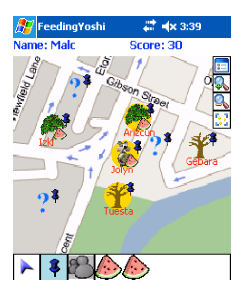
Figure 1. In the map screen, Yoshis and plantations are shown as icons, and navigation controls are on the right. Near the bottom is a row containing (from left to right) a button for selecting icons, pinning an icon onto the map, initiating a swap with another player (greyed out), and the basket of up to five fruit: in this case two melons.

Feeding Yoshi is a mobile multiplayer game that is played over a relatively long period—the game we report on here lasted a week. Rather than being built on the assumption of users' continuous engagement over such a long time, we assume that players use the system intermittently, as they go through their normal daily routines of work and leisure.