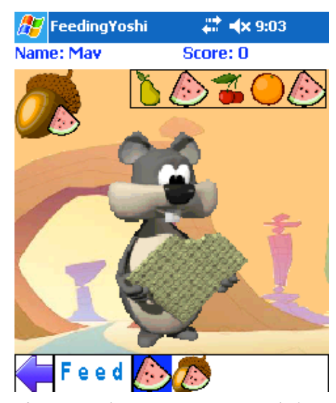
Figure 2. The Yoshi screen shows the Yoshi himself, as well as the five fruits he currently desires (top right) and a seed of his favourite fruit (top left). After selecting one or more of the fruit in the basket (bottom right), the Feed button is used to feed the Yoshi and gain points. The left arrow returns to the map.

On first being detected, a Yoshi or plantation appears in the centre of the currently displayed area of the map, although a player can 'pin' a Yoshi or plantation icon in a better place. On the right hand side of the map are buttons for switching to a list view rather than the map, panning, zooming and selecting a Yoshi to be highlighted on the map as a 'favourite'. Along the bottom of this screen, and also shown in the other two screens in the game, is the player's 'basket' that provides space for a limited number of fruits and seeds to be carried. Clicking on a Yoshi brings up a screen showing the Yoshi, a seed for his favourite fruit, and the five fruit he currently wishes to eat (Figure 2). Similarly, clicking on a plantation leads to another screen with either a tree empty of fruit, i.e. an unseeded plantation, or a tree with fruit ready to be picked, i.e. a seeded plantation. Seeding is done by selecting a seed in the basket then clicking a Seed button.