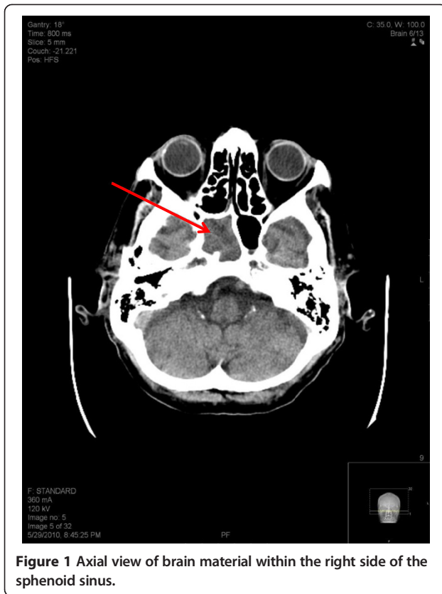
Figure 1 Axial view of brain material within the right side of the sphenoid sinus.