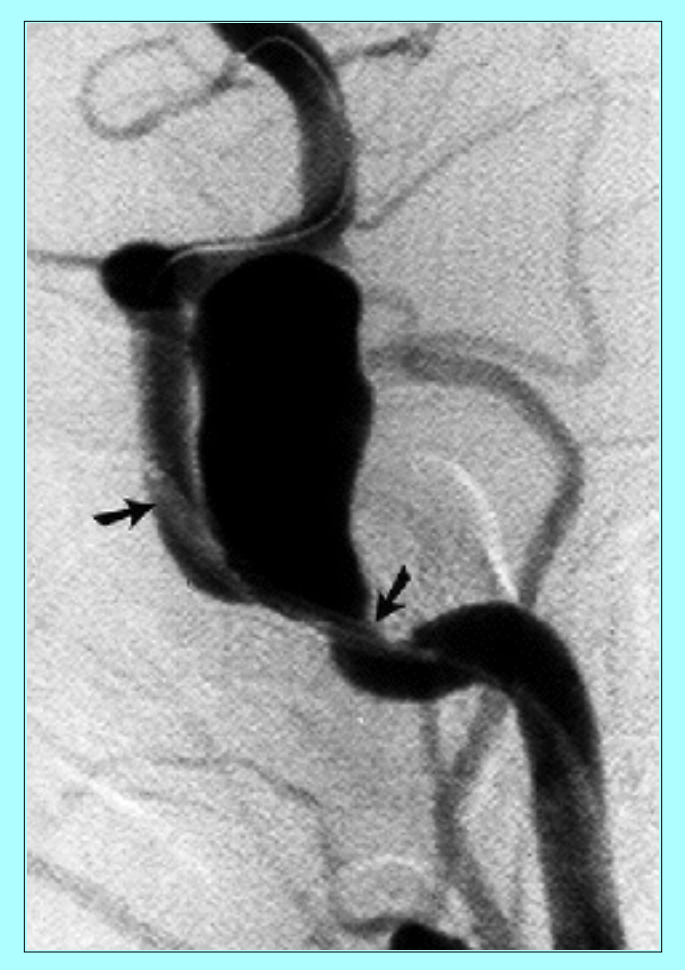
Fig. 1. Digital subtraction angiogram, oblique projection, revealing a giant aneurysm at the junction of the petrous and cavernous portion of the ICA. An intravascular balloon-expandable stent, mounted on its delivery system (arrows), is present across the neck of the aneurysm.

Following stent deployment, digital subtraction angiography with selective ICA injection showed persistent filling of the aneurysm; however, intraaneurysmal flow appeared to be slower. Due to the persistent aneurysm filling and the need for postprocedural antiplatelet therapy that would interfere with aneurysm thrombosis, we elected to perform secondary GDC placement in the aneurysm. Selective aneurysm catheterization with a microcatheter over a microguidewire was performed through the stent struts. A total of 13 GDCs of different sizes and characteristics were progressively delivered into the aneurysm sac (Fig. 2). At this point, significant (> 90%) aneurysm occlusion was achieved. The aneurysm's irregular shape, however, precluded angiographic visualization of the separation between it and the parent vessel, thus incapacitating the safe delivery of additional coils. Therefore, the procedure was considered to be complete after placement of the 13 coils. Contrast material stasis in the aneurysm remnant was observed, leading us to conclude that, given the extensive coil packing, complete aneurysm thrombosis was likely to occur after discontinuation of anticoagulation therapy.