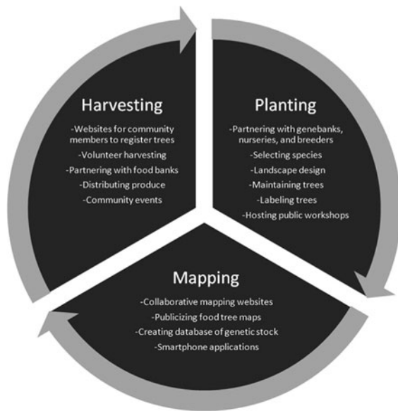
Fig. 1 Urban food forestry initiatives can be divided into three distinct elements, or pillars: planting, mapping, and harvesting urban food trees. This cycle diagram describes some of the activities being undertaken by initiatives focused on each pillar. These pillars act synergistically to support the establishment, maintenance, and utilization of urban food trees

two organizations (Common Ground and LifeCycles) had produced free handbooks on establishing and running community fruit harvesting initiatives.