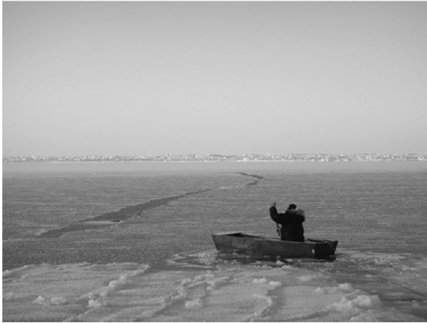
Fig. 2. Inuit hunter, Adam Kolouhok Kudlak, retrieves a ringed seal natiq from the open water lead aolagot near Holman Island Qikiktakyoak using an open water boat oinikhiot on 20 February 2009.

recently there have been years when there has been open water and/or very thin unstable temporary ice cover that is vulnerable to winds and current (Fig. 2).