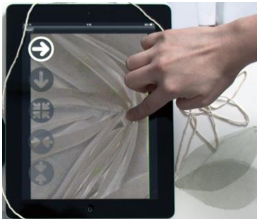
Figure 1. iShoogle tool showing fabric being stroked. iShoogle [2,7] is an interface that allows for interactive simulation of digital textile handling (synchronised movement and visual feedback) on a touch-based display.

descriptors only partially support designers during the textile selection process, as they need to synthesise not just technical information, but also sensory and affective experience around textiles, and their related meanings [8]. Unfortunately, as literature shows [6], articulating our tactile experiences is a challenging task. Hence, in this paper we introduced research tools to interrogate how designers interact and use their sensorial body to experience textiles during the creative process. Such research tools were purposely introduced to disrupt the way designers generally interact with textiles, and were brought in not as a solution, but to invite designers to reflect on how they interact with textiles from a sensorial perspective.