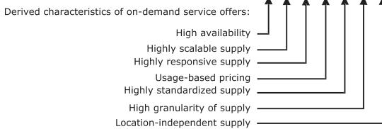
Table I. Overview of literature

literature. Further, on-demand services are often linked to access-based services (Lawson et al. , 2016; Schaefers et al. , 2016) and the sharing economy (Fehrer et al. , 2018; Kumar et al. , 2018). In some cases, there is indeed a clear link between these concepts, but also an important difference: sharing resources and offering access to goods does not automatically mean these are supplied instantaneously on demand. On-demand provisioning is also often related to multi-sided platforms (Andreassen et al. , 2018; Hagi and Wright, 2015; Parker et al. , 2016). Such platforms are frequently used by service providers to collect available resources for on-demand supply. At present, these platforms are frequently studied, focusing on topics such as pricing and capacity management (Bai et al. , 2018; Taylor, 2018). However, again, it is important to note that multi-sided platforms are not necessarily on-demand.