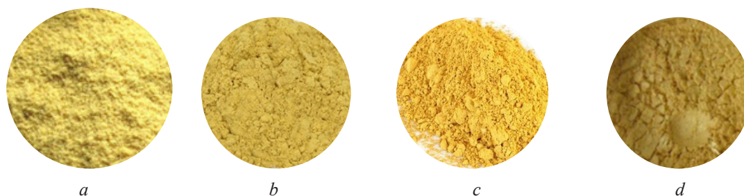
Fig. 2. Samples of bee pollen of different dispersity degrees: a – 115 \pm 5 mcm; b – 20 \pm 2 mcm; c – 15 \pm 2 mcm; d – 10 \pm 2 mcm

The increase of bee pollen powder dispersity causes phytochemical changes that lead to flavonoids content variations (Fig. 3).