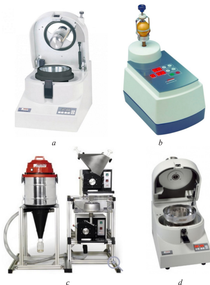
Fig. 1. Highly effective comminutors: a – mill-pestle; b – ball mill; c – cutting comminutor; d – striking comminutor

Using the modern comminutors (Fig. 1) bee pollen can be comminuted to sizes, varied from 120 to 8 mcm (Fig. 2).