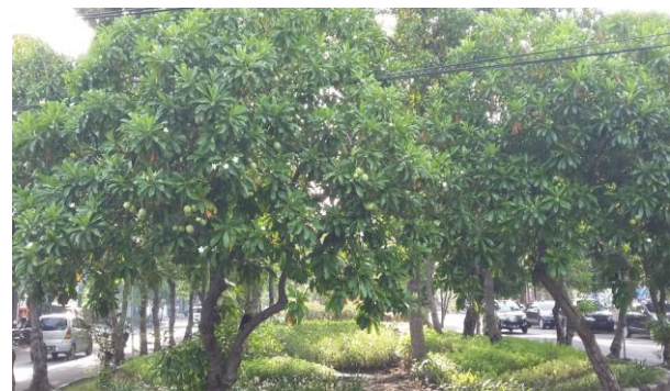
Figure 1. City Park with Cerbera manghas , Surabaya, Indonesia

Trees are the main element in the city park, and they are useful in improving the air quality in densely populated cities such as Surabaya as shown in Figure 1. On the other hand, planting a large number of trees causes a lot of waste from leaves as shown in Figure 2. Government and many communities in Surabaya are facing serious issues with the solid waste leaf from the Cerbera manghas plant. Disposal problems and considerable efforts are being made to reduce the quantities of municipal solid waste.