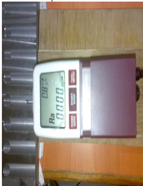
Fig.2 Mitutoyo Surftest Instrument SJ-201P

Surface Roughness basically depend upon the feed rate, spindle speed, tool diameter and depth of cut. It is important output characteristic in milling or every machining process because SR has direct relation with the quality. And quick and high production is the need of modern production system. In end milling, the cutter generally rotates on an axis vertical to the work piece.