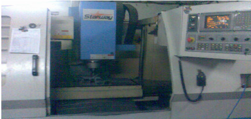
Fig.1 Starway's Vertical Machining Center VMC-850