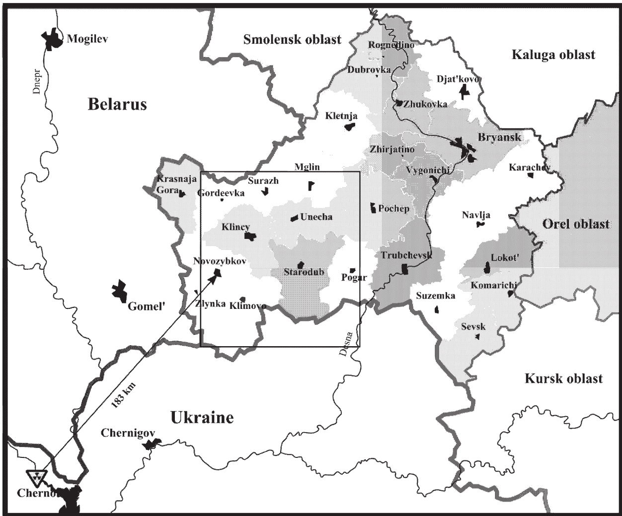
Figure 1 Map of the Bryansk Oblast of the Russian Federation. Small subdivisions are raions. Box indicates the approximate study area

measurements. Key factors in the model include ^{137}\text{Cs} contamination levels in settlements, ^{131}\text{I}/^{137}\text{Cs} ratios in depositions within settlements, timing of the arrival of the radioactive cloud, type of fallout (wet or dry), pasture feeding patterns of dairy cattle, milk and leafy vegetable consumption, source of milk and leafy vegetables, location of food source, the use of counter-measures to reduce exposure, and an individual's age. The mean thyroid dose for those aged 6–18 was estimated for each settlement in the study area. These estimates were then averaged across settlements within each of the four zones as defined above by level of urinary iodine, taking into account the mean dose for each settlement and the number of people aged 6–18 in the settlement.