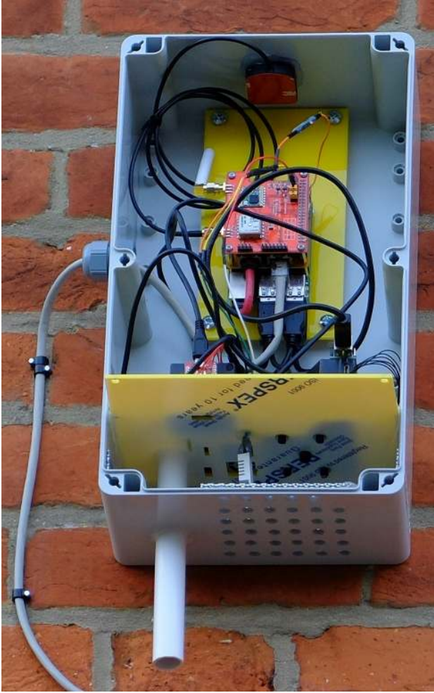
Fig. 2. Air Quality IoT device deployed on an external wall

recirculation. Figure 2 shows the complete Air Quality IoT device deployed on an external wall located at School A, (see Figure 3 for school location).