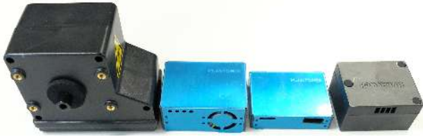
Fig. 1. Particulate matter sensors Alphasense OPC-N2, Plantower PMS5003, Plantower PMS7003, Honeywell HPM115S0