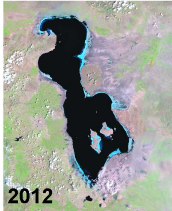
Figure 3- Substantial reduction in the area of Lake Urmia over the past decades due to growth-oriented development plans, inefficient agricultural practices, and aggressive upstream water storage and diversion in addition to some climatic variabilities (modified after AghaKouchak et al. 75 ).