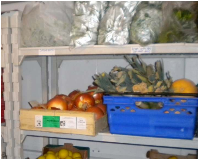
Fig. (8). Cold storage at restaurant includes both local “leaves” labeled on the top shelf and imported organic vegetables.

Some problems were identified associated with sourcing local produce, to which two responses emerged: replacement and adaptation. Additional cold storage was needed to compensate for less frequent deliveries of organic meat and vegetables by individual producers (Fig. 8). One chef referred to this factor and to price in rationalizing his shift from a local organic producer to a conventional wholesaler: “The larger multinational companies...could offer better prices, more discounts. We buy more from them now; better prices with same quality.” (This contrasts sharply to other interviewees who felt there was clear superiority to local organic vegetables.) This same chef also said that sometimes he had to buy French- or Icelandic-caught fish in winter because of the non-availability of required species from Irish fishermen. By contrast, other chefs adapted their menu to the fish species that were available on a given day. Chef 7 referred to the sense of adventure in planning a menu in advance when aspiring to use local food: “At first I changed menu every day according to what we ‘tripped over’ in the boxes...cooking off the bat like that. That was brilliant...we did that for all of December and then it got to the ‘like craggy months’ of Winter” and they were forced to develop a set menu from more conventional wholesale suppliers.