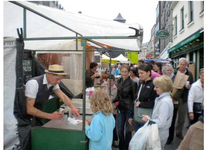
Fig. (2). Galway Farmer’s Market with produce, artisan and local foods (here Donuts).

food products (air dried beef and lamb) are available. Connemara lamb from a mountainous area northwest of Galway City, holds a European Union (EU) Protected Geographical Indication (PGI) quality food label [48]. There are a handful of farm cheese producers and a small but growing number of organic vegetable and beef producers located in County Galway and in the adjoining counties of Roscommon and Clare. A traditional weekly farmers’ market is frequented by a wide range of small scale food producers and processors (Figs. 2, 3).