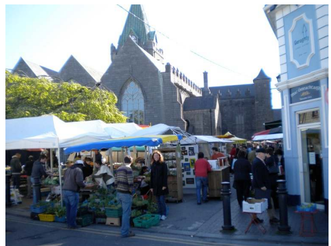
Fig. (3). Galway Farmers’ Market is weekly, year around.

Galway has a well educated middle-class resident population with disposable income. It also has a developed tourist market and substantial demand for dining out, which is met by over 135 restaurants (there are also as many as pubs which serve food). A small number of these restaurants advertise their use of local produce and are recognized for doing so in national and international food guides.