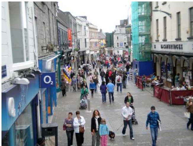
Fig. (4). Shop Street in Galway Ireland; all six surveyed restaurants are in close proximity to this main area of commerce.

Following review of recognized national food guides and the websites and menus of restaurants in Galway, six were identified which promote the use of local food in their kitchens (Fig. 4). Their seating capacity varied from 45-90 persons. Interviews were conducted with a key decision-maker in sourcing food in each restaurant: the owner, the manager, or the head chef. In one case both the owner and the chef were interviewed because they were jointly influential in determining the menu. All interviewees are referred to anonymously as Chef 1, Chef 2, etc., although several were managers or owners rather than chefs. The interview guide focused on the business profile and on the three research objectives. These components specifically allowed for gathering a broad range of information on chefs' perceptions and actions regarding local food, which illuminate the ways in which restaurants play a role in the development of local food value chains.