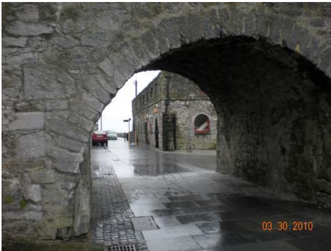
Fig. (6). Spanish Arch, built in 1584, represents historical influence of European trade with Ireland.

organic produce on the menu. Chef 5 worked in the longest-established of the restaurants (opened in the mid-1990s) and referred to the higher quality of local produce, to supporting local producers economically and to the convenience of having local suppliers. Chef 6 paralleled Chef 1, in owning more than one business and holding strong philosophical ideas relating to local food. Chef 6 has an eclectic style that is reflected in the restaurant, which incorporates both Irish and international cuisine. Chef 7 who works in a restaurant owned by an investor in the food and drinks sector, previously worked with Chefs 1, 3 and 6 and holds a degree in hotel and restaurant operations, as well as professional qualifications as a chef. The restaurant conveys a non-formal ambience and attracts a young clientele in the late evenings. It has a greater emphasis on using organic produce than have the others and a mission to use exclusively Irish food produce.