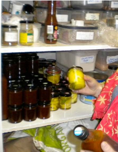
Fig. (7). Chutneys and preserves made by Chef 7.

West Cork [50]. Local was also extended to include artisanal produce from other European countries, an international dimension less well documented in published literature. Grains, lentils, chickpeas and wines were sourced through specialty importers. Thus Chef 7 described: “Flour is organic...buy in England if cannot get in Ireland...organic pasta...barley from the UK.” Two restaurants imported wine through agents who dealt with specialty producers in Italy, Spain and New Zealand.