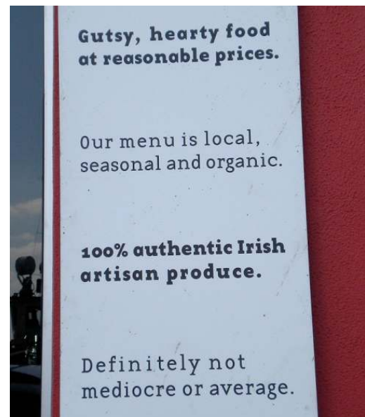
Fig. (5). Restaurant sign advertises their perceived importance of local and organic food.

Five male and two female chefs were interviewed. One was aged 45-54 years; the others were aged 25-34 years. Two held professional qualifications in cooking and in catering, respectively; the others held a range of other qualifications. With one exception, the restaurants were established in 2008-09, as economic recession was impacting in Ireland. This apparently inauspicious timing appeared to have been influenced by falling rents and properties becoming available. A deep interest in food, in local ingredients, and in demonstrating use of those ingredients were the reasons cited for opening and working in the restaurants, as described by one chef: "I wished to stay in Galway...to showcase food from round Galway. A lot of people are creating fantastic food and ingredients and no one is showcasing them in a proper way." (Fig. 5). The chefs are profiled briefly in order to contextualize the analysis of their narratives. They are numbered in order of interview.