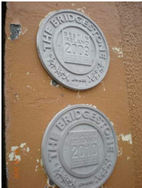
Fig. (9). Example of the award plaques which may be displayed if a restaurant owner pays a significant fee.

Geography: Place and Culture 100 Kilometer Radius defacto sourcing Stretching to include artisan produce Ireland International Scale dimensions market opportunities small scale producers Locals and Tourists willingness to pay knowledge varies Lack Irish food culture Motivation: Economic and Personal Quality of local products Producers cooperation meet chefs’ needs Consumers interest, knowledge Storage/Seasonality Creativity menu variety, adaptation Marketing artisan consumer expectation prize winning niche local plus art/creative local plus artisan/international Local Food Source and Promotion Intermediaries butchers regional, family business wholesale vegetables long supply chain Authenticity “local” not chef’s responsibility wholesaler excludes small scale local producers menu implies more than reality