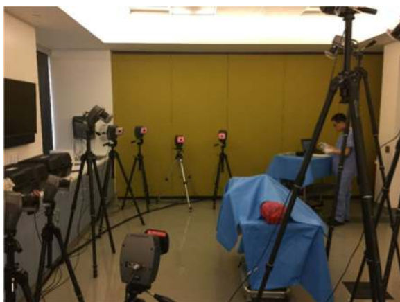
Fig. 2 Room set up for the measurements. An operating room (OR) table was positioned in the center of twelve motion analysis cameras on tripods at different heights and angles. These cameras were pre-calibrated prior to each measurement session

Overall, 120 measurements were obtained for each joint motion using each of the three techniques. This was repeated for (A) hip flexion, (B) hip abduction, (C) hip internal rotation, (D) hip external rotation, (E) knee extension, and (F) knee flexion (see Fig. 3). Digital