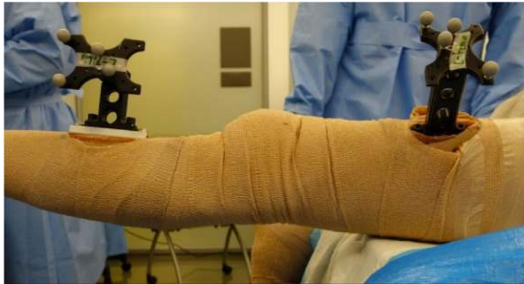
Fig. 1 Photograph demonstrating the arrays of reflective markers used for infrared motion capture analysis, which are fixed to the femur (right) and the tibia (left) using a combination of screw fixation and bone cement

This process allowed for accurate joint angle calculations to be performed in real-time during measurement sessions.