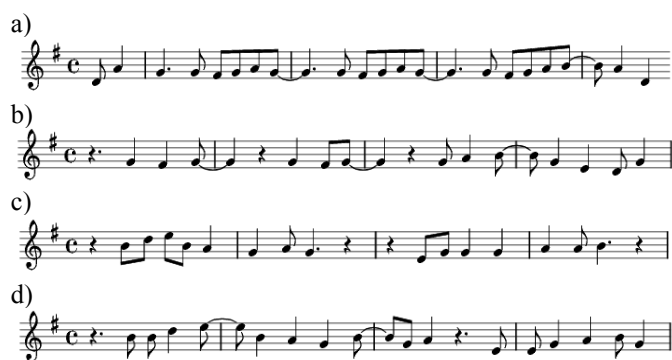
Figure 2. Four melodies: a) PINK, b) TK9683-1, c) COOKE, d) TK9683-2

1) Similarities between hit songs and subjects’ songs. In this case we arrived at two pairs with significant similarities: PINK vs. TK9683-1 (cf. Fig. 2a and 2b) and COOKE vs. TK9683-2 (cf. Fig. 2c and 2d). Interestingly, the two four-bar melodies originated from one single subject (TK9683), an experienced musician and songwriter, who had delivered an eight-bar melody with two clearly distinct four-bar parts, that entered the analysis as different four-bar melodies.