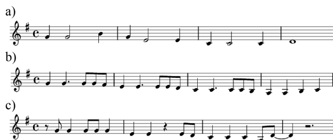
Figure 3. Three melodies by participants: a) JOE28, b) JAG23, c) MAR17

For possible cases of independent (re-)creations these quite similar pairs of melodies make a good point. Yet, no final conclusion can be reached, as these similarities could be explained by the simple process of following the roots of a given chord sequence. Thus, it could be argued that these melodies lack originality, particularly with hindsight to the context as set by the backing track, so the evident similarities could be deemed trivial.