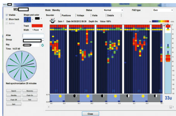
Figure 2 Picture of echosounder readings from the screen of a computer onboard a purse seiner in the Atlantic ocean showing fish biomass underneath a fish aggregating device (FAD) as observed by an echosounder buoy attached to the FAD. The image covers 4 days with information provided by the echosounder every 2 h. An aggregation of fish (likely to be tunas) is observed between 20 and 70 m. These data do not allow species discrimination.

Purse seiners are not the only fisheries catching tropical tunas and there is regional variability in the percentage of the overall catch that is taken by purse seiners fishing on floating objects (Fig. 3). Other major tuna fishing gears are longline and pole and line. In the western and eastern Pacific oceans, catches on floating objects (drifting and anchored) account for about 50% of the overall catch of tunas in these oceans, while they only represent about 25% in the Indian and Atlantic oceans (Fig. 3). The increasing trend in the western and central Pacific oceans (which currently accounts for over 50% of the world tuna production) is quite noticeable. The trend in this region since 1990 is because of an increase in the use of both drifting and anchored FADs (Fig. 3). Globally,