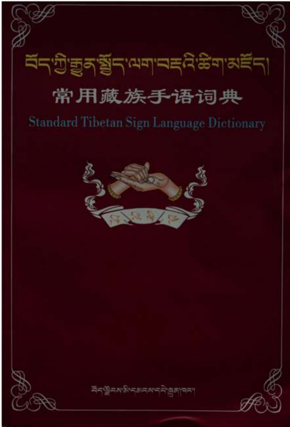
Figure 6: Front cover of the Standard Tibetan Sign Dictionary (TDA 2011).

Published by the governmental “TAR People’s Publishing House”, it has received official acceptance and in the process had engaged several different stakeholders and national and international sign experts. Local government offices (in addition to TDPF), such as the TAR Education Bureau, the TAR Language Committee and the Lhasa Special School were involved, demonstrating relatively high-profile and official support. The dictionary is again organised according to domains of life, yet this time features an expanded introduction as well as an appendix explaining – in Tibetan, Chinese and English – some key grammar rules of signed languages in general, and of TibSL in particular. It is one step closer to being usable also as a TibSL textbook, rather than just a dictionary. The quality of the sign representation has also been improved, featuring real photographs that have been professionally edited, using arrows