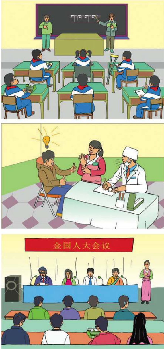
Figure 8: Artworks by a Tibetan artist to advocate the use of sign language in school, medical settings, and politics. Courtesy and copyright: Chogoen and HI.