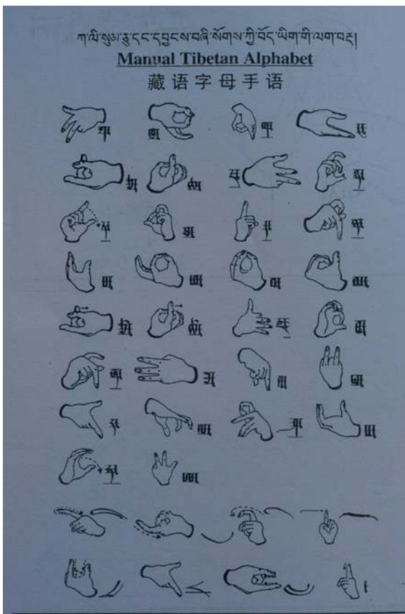
Figure 3: The Tibetan Sign Language finger alphabet (TDA 2005: 100).

These volumes were again given out for free. During the work, the need for a Tibetan finger alphabet had arisen and led to the birth of the TibSL manual alphabet (see Figure 3). It follows and honours the shape and form of the 30 consonants, 4 vowels and the main subscripts of the Tibetan alphabet, as written in u med (“headless”, or cursive) script and shows no influence from either IS (International Sign) or American Sign Language (ASL) finger spelling, which both relate to the Roman alphabet used to write many European languages and are therefore of no use. It replaced an earlier finger alphabet developed in 2000/2001, which used two hands for seven out of the thirty consonants, but it was subsequently considered impractical in daily use.