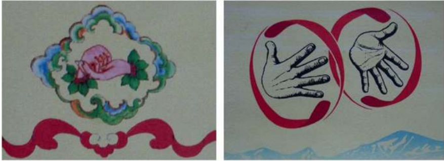
Figure 4: The front and back covers of the Tibetan Alphabetical Sign Dictionary showing TibSL for TIBETAN (left) and TibSL & IS for SIGN (right), together constituting the TibSL sign BÖKYI LAGDA or ‘TIBETAN SIGN’.

TibSL itself, the language is referred to in a combination of TibSL and IS, as shown on the front and back cover of the DVD-based dictionary (Figure 4). TibSL for bö , or Tibet – and from now on I will use capital letters to render TibSL signs – is two hands in the action of preparing pak , a ball of tsampa , the staple food of most Tibetans. IS for SIGN is shown on the back of the DVD and