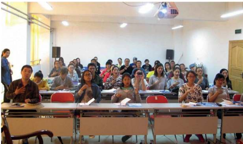
Figure 7: Students of a TibSL course held in Lhasa, summer 2014.

iSLANDS adds a further criteria, namely the Status of Language Programmes, knowing that many signers depend on these more than when learning spoken languages. This additional element refers to programmes aimed at promoting the use and maintenance of the language, ranging from summer schools to sign language competitions and regular language classes. I would give this a score of 2, meaning basic, and that “a programme is running involving <5% of the community, irregularly and with few or no outcomes” (Zeshan et al. 2011: 13). The main reason for this score is that only 10–15 people regularly attend the Friday afternoon TibSL courses, moreover other more intensive (summer) courses were recently blocked or delayed by the TDPF (although they eventually allowed a ten-day training course to occur, see Figure 7).