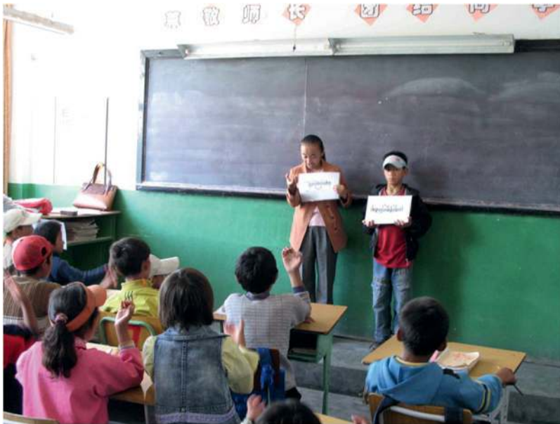
Figure 5: Pupils learning new TibSL signs and finger spelling in an extra-curricular class at the Lhasa Special School, 2007.