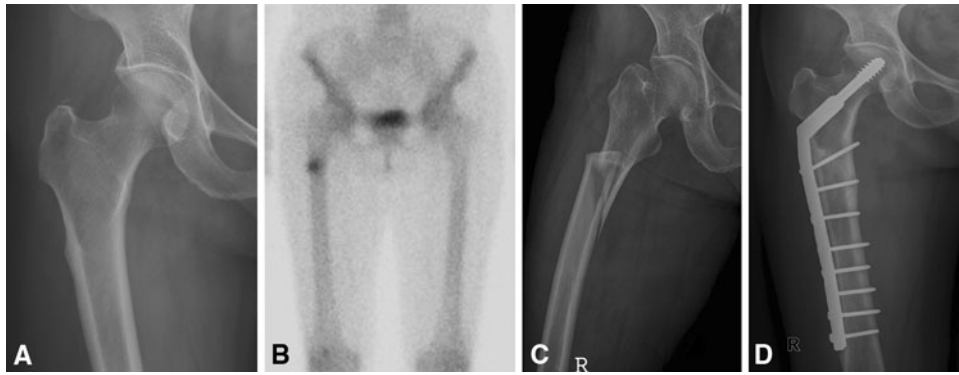
Fig. 1A–D Patient 4 was a 67-year-old woman who had pain in her right thigh. (A) Her radiograph shows a transverse fracture line and thickening of the lateral cortex at the subtrochanteric area. (B) Her bone scan shows hot uptake at the subtrochanteric area. (C) She

experienced a slip after 1 month of followup. Her radiograph shows a completely displaced fracture. She underwent internal fixation using a compression hip screw. (D) Twelve months postoperatively, her radiograph shows complete union of the fracture.