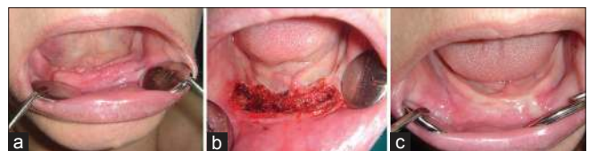
Figure 1: (a) Preoperative view of the epulis fissuratum lesion of a patient, (b) immediate postoperative view of the treated area, (c) view of the treated area two weeks after diode laser intervention

Four patients with pyogenic granuloma, diagnosed