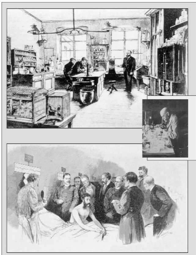
Fig. 2 Looking back: Koch's greatest success and failure. Upper: Robert Koch, the discoverer of the TB bacillus, in his laboratory. Lower: Treatment of a TB patient with Koch's remedy, a therapeutic vaccine that turned out to be non-efficacious and even harmful.

tive immune response against TB, CD8 + T cells are needed as well. In addition to these two major T-cell populations, unconventional T cells, namely \gamma\delta T cells and CD1-restricted \alpha\beta T cells, apparently participate in optimum protection. In contrast to M. tuberculosis , BCG fails to adequately stimulate CD8 + T cells, probably because it has lost essential cytolysins. On the other hand, the ligands for \gamma\delta T cells and CD1-controlled T cells are present in BCG.