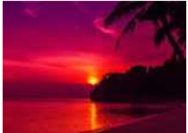
Figure 1. According to the first and perhaps most important unresolved historical criticism of Einstein gravitation, Sunset is a visual evidence of the lack of actual, physical, curvature of space because we still see the Sun at the horizon, while in reality it is already below the horizon due to the refraction of light passing through our atmosphere. Exactly the same refraction without curvature of space occurs for star-light passing through the Sun chromosphere, in which case the only "bending of light" is that due to Newton's gravitation in a flat space (see Section 2). Note that Einstein gravitation cannot represent light refraction because it requires a locally varying speed of light within a medium, first with increasing and then decreasing density. Hence, the representation of refraction via the curvature of space violates visual evidence, physical laws and experimental data [111-15]. To achieve a credible proof that the bending of Star-light passing near the Sun is "evidence" of the curvature of space, Einstein supporters have to prove that star-light passing through the Sun chromosphere does not experience refraction. The impossible existence of such a proof is readily seen from the fact that Einstein gravitation was solely aimed at a description of "exterior gravitational problems in vacuum," while the propagation of star-light within the Sun chromosphere is strictly an "interior gravitational problem" treated later on in Section 5. Its description via the Riemannian geometry is beyond any realistic possibilities due to the need for a metric possessing a dependence on coordinates x , as well as density \mu , temperature \tau , frequency \omega , etc. g = g(x, \mu, \tau, \omega, \dots) (see Sections 5-11 below).

of bodies in a gravitational field, and other basic events that are clearly represented by Newton gravitation.