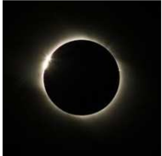
Figure 3. A view of a Solar eclipse showing no "bending of light" because the Newtonian attraction of light by the moon is extremely small and there is no refraction due to the lack of lunar atmosphere. The faint luminescence at sea level is due to the diffraction of light in our atmosphere. In conclusion, final claims of "bending of light due to curvature of space" must be based on star light passing tangentially on a body without atmosphere or chromosphere and be proved to be greater than the Newtonian attraction.

Again, the author has experienced over decades huge emotional reactions by colleagues at the instant of examining Einstein's reduction of gravitation to pure geometry, Eq. (2), without any in depth inspection of the advances permitted by a source term as in Eqs. (3)-(4). In a nutshell, the alternative between Eqs. (2) and (3), (4) boils down to the belief of the existence of local infinities in the universe or not. Eqs. (2) do admit these local infinities, while covering Eqs. (3), (4) recover all main results of Eqs. (2) except replacing local infinities with large, yet finite values (Section 5 and Subsection 5.10 in particular).