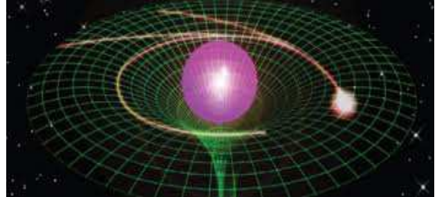
Figure 5. Another illustration of the insufficiencies of the one century old assumption that planets moving around the Sun in our Solar system actually move along a real, physical curvature of space. The historical criticism is that the above representation is purely mathematical because, to actually sense curvature in a three-dimensional space, the planet should move in a fort space dimension that does not exist.

pre-judgments by colleagues mainly due to decades of research with covariance in gravitation without a serious inspection of qualified alternative views. In reality, serious judgments can only be expressed after a technical knowledge of the huge possibilities for further advances in gravitation permitted by alternative invariant theories (Section 5).