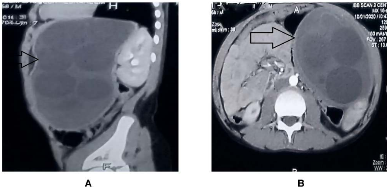
Figure 1 Axial (A) and sagittal (B) view of abdominal CT scan showing a calcified wall splenic hydatid cyst (arrow).

In the left hypochondrium, xray showed a well-defined, rounded soft tissue opacity with some marginal calcification. The chest X-ray was normal. A large solitary 20×16×18cm cystic mass in the spleen's hilum was detected in the abdominal ct-scan. It was sharply margined and contained multiple round calcified peripheral daughter cysts (Figure 1). No other cystic lesion was detected in other organs such as the liver and peritoneum. Echinococcus latex hemagglutination