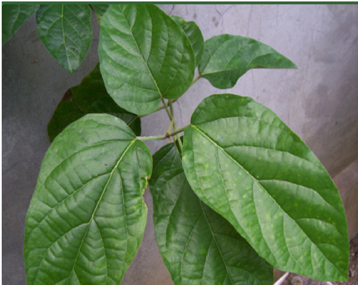
Figure 1. Leaves of P. odorata .

(solvent B). The gradient elution was as follows: 20% B for 0 to 10 min, 20 to 40% B for 10 to 20 min, 40 to 60% B for 20 to 30 min, 60 to 80% B for 30 to 40 min, 80 to 95% B. The post-running time was 10 min. Flow-rate was set at 1.0 mL/min. The UV-Vis detector was set at 254 nm. The column was maintained at room temperature.