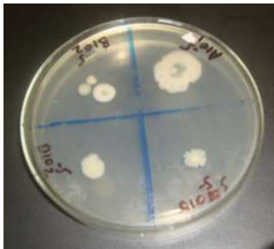
Figure 2. Amylase activity analysis on Petri-dish.