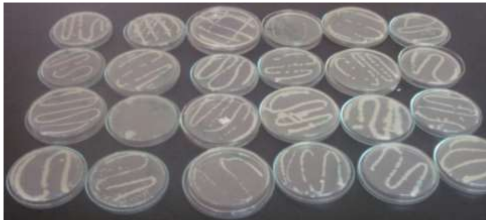
Figure 1. Morphology and biochemical tests.