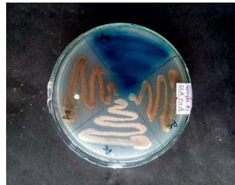
FIGURE 3: Production of pigment by sample A5, A6, A7, and A8 in the SCA medium.

different pigments like green, orange, white, yellow, and brown were extracted from actinomycete isolates and were purified and tested for antimicrobial activity which showed that all extracted pigments inhibited growth of E. coli , Staphylococcus aureus , Bacillus subtilis , and Salmonella typhi except the yellow pigment which showed inhibitory effect against only Gram-negative bacteria [14].