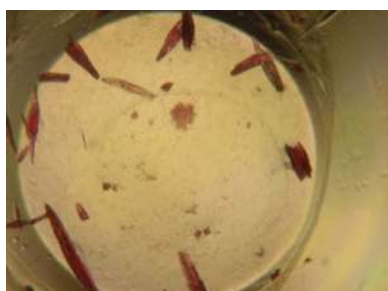
© 2005 International Union of Crystallography All rights reserved

The best characterized corrinoid protein from M. thermoacetica is the CFeSP and, as discussed above, it transfers the methyl group of methyltetrahydrofolate to the CODH/ACS. It is an \alpha\beta dimer having two subunits of 33 and 55 kDa. The smaller subunit carries the corrinoid 5-methoxybenzimidazolylcobamide, whereas the larger subunit contains the [4Fe-4S] cluster (Ragsdale et al. , 1987; Lu et al. , 1993). A second corrinoid protein designated MtvC (Naidu & Ragsdale, 2001) is part of a three-component vanillate O -demethylase system. This enzyme system may have a broad specificity and be involved in the transfer of methyl groups from a number of methoxylated aromatic compounds functioning as methyl donors (Daniel et al. , 1991). A similar system has been described for the acetogen Acetobacterium dehalogenans (Kaufmann et al. , 1998; Engelmann et al. , 2001). A third corrinoid protein of 27 kDa has also been purified from M. thermoacetica , but its function has not been ascertained (Ljungdahl et al. , 1973; Ragsdale et al. , 1987).