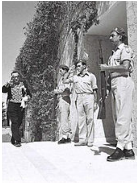
Figure 2.1. Iranian Foreign Minister Reza Saffinia arriving at the house of Israeli president Chaim Weizmann in Rehovot on Yom Ha'atzmaut, 1950. 8

where the Israelis were welcome at the time.” 6 In his recent book Iranophobia: The Logic of an Israeli Obsession , Haggai Ram cites an article in the Israeli daily, Davar , describing the life of Israelis in Iran in those days: “Most Israelis congregated in Iran as representatives of medium and large companies where they rented offices, sometimes buildings, hundreds of cars and hundreds of apartments. They took part in the best parties, attending French and Italian operas imported for foreigners. Most had maids imported from the Philippines.” 7