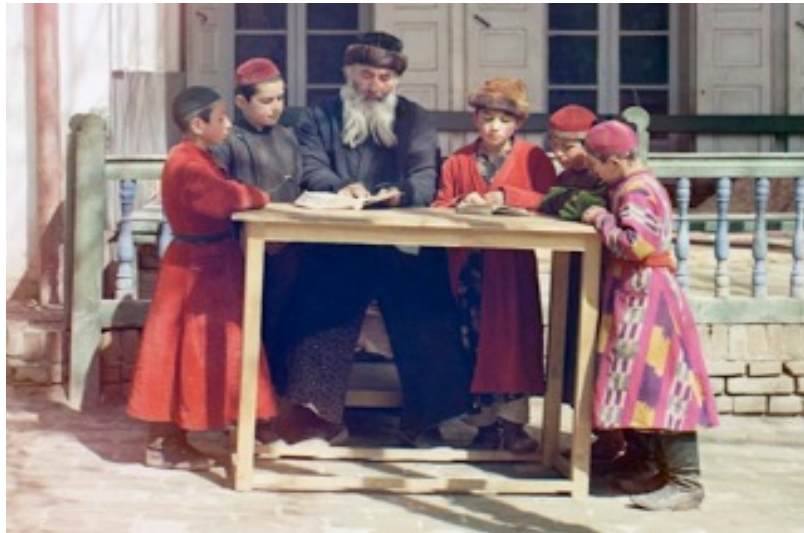
Figure 1.3. 1910 photo of Jewish children in Samarkand with their Rabbi (modern Uzbekistan). 14

The Jews prospered until the Romans arrived, razing Jerusalem in 70 AD and causing the Jews to flee to other countries in the Middle East, many to Persia. The Jews, in diaspora, were generally unwilling to assimilate and usually resided in ghettos in the various countries to which they fled. They maintained their culture by learning Jewish history, laws, and customs because of ardent education from their rabbis, in spite of repeated, often violent, oppression. After all, they were God's "special" people and they were determined to survive, as Jews.