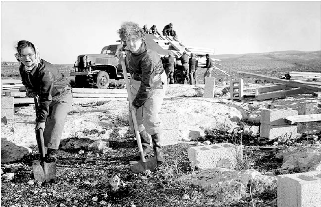
Figure 1.5. In 1949 immigrants flocked to Israel, then one year old. 46 Associated Press. Photograph courtesy of The Associated Press.

pay with their territory for the crimes committed in Europe against the Jewish people? Why should Arabs be asked to accept the biblical claim of a religion they do not themselves embrace?” 45 After Israelis defeated the immediate attack by the Arab states (Egypt, Syria, Lebanon, Jordan, and Iraq) in 1948, they began to accept more immigrants to help build their new country.