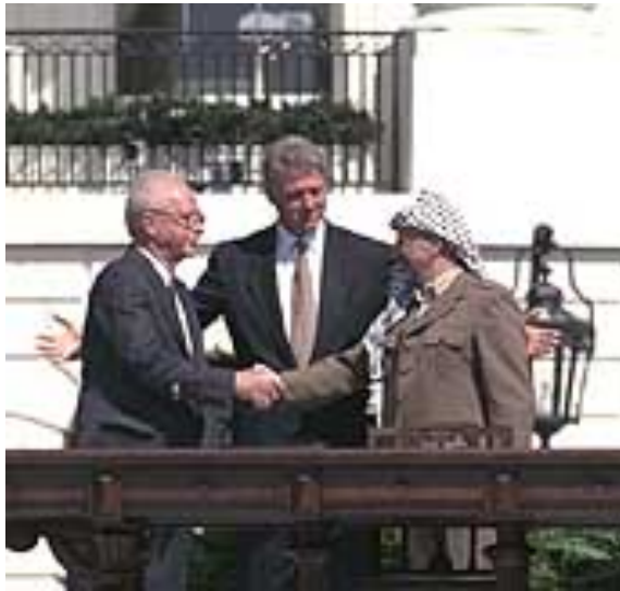
Figure 4.1. The Handshake: Israeli Prime Minister Yitzhak Rabin and PLO Chairman Yasser Arafat with US President Bill Clinton, September 13, 1993. 12

including universal access, and was willing to exit Lebanon and the Golan Heights in exchange for the right to exist within “secure borders.” 10 Peres had always hoped the Arabs would produce another leader like Anwar Sadat to negotiate with, lamenting that if “Ben-Gurion had had a realistic counterpart, the history of the Middle East would have been different.” 11