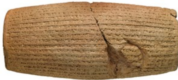
Figure 1.2. The Cyrus Cylinder. 13

The 1878 discovery of the Cyrus Cylinder in Mesopotamia refers to Cyrus liberating slaves from Babylonia but does not mention the Jews specifically. It seemed to have been a bigger deal to the Jews than to the Persians.