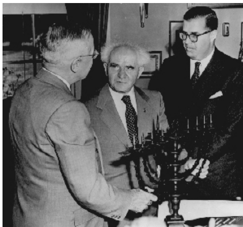
Figure 1.4. President Harry S. Truman meeting with Prime Minister David Ben-Gurion of Israel and Israeli Ambassador Abba Eban on May 8, 1951. 43 President Truman is receiving a gift of a menorah.

Eleven minutes after the State of Israel was announced on May 14, 1948, in Tel Aviv, the United States gave de facto recognition. 41 After Turkey, Iran was the second Muslim nation to recognize Israel as a sovereign nation; the Soviet Union soon followed with the more formal de jure recognition. 42