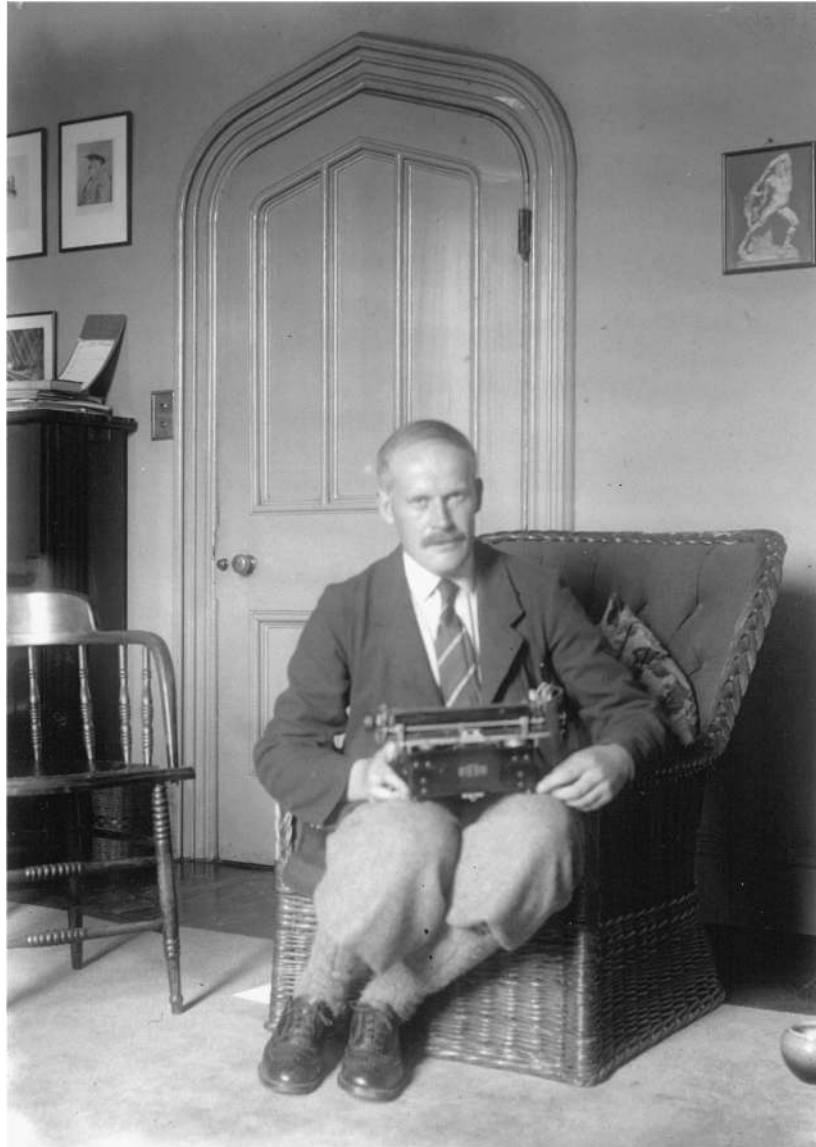
FIG. 3. Sir Harold Jeffreys (1891–1989) in 1928.

gives any ground for inferring a difference between the corresponding ratios in the complete populations. Let us suppose that in the first population the fraction of the whole possessing the property is [\theta_0] , in the second [\theta_1] . Then we are really being asked whether [\theta_0 = \theta_1] ; and further, if [\theta_0 = \theta_1] , what is the posterior probability distribution among values of [\theta_0] ; but, if [\theta_0 \neq \theta_1] , what is the distribution among values of [\theta_0] and [\theta_1] . (p. 203)