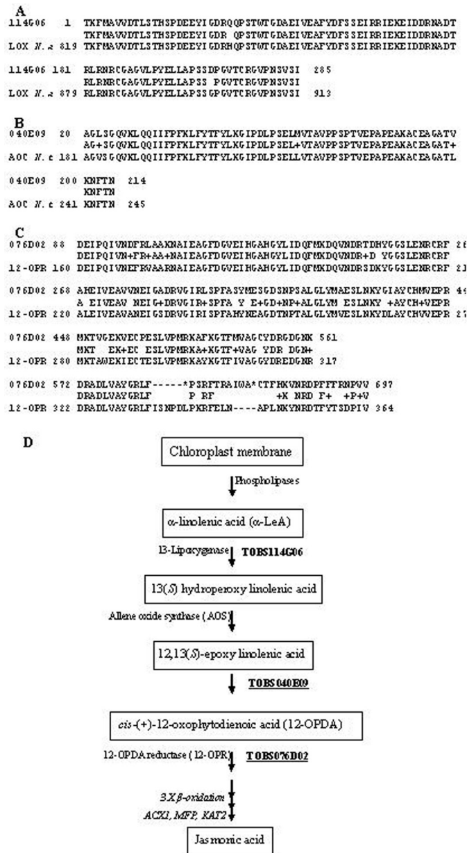
Figure 3. Analysis of the main enzymes of the jasmonate biosynthesis pathway identified in the TOBEST database. A. Alignment of the lipoxygenase (LOX) from Nicotiana attenuata with the deduced amino acid sequence of the TOBS114G06 clone (97% identity). B. Alignment of the allene oxide cyclase from N. tabacum with the deduced amino acid sequence of the TOBS040E09 clone (95% identity). C. Alignment of the 12-OPDA reductase (12-OPR) from Ricinus communis with the deduced amino acid sequence of the TOBS076D02 clone (83% identity). D. Simplified model of jasmonic acid biosynthesis pathway. The TOBEST clones are shown at the right side of the figure and are highlighted in bold and underlined, side-by-side with their corresponding enzymes.