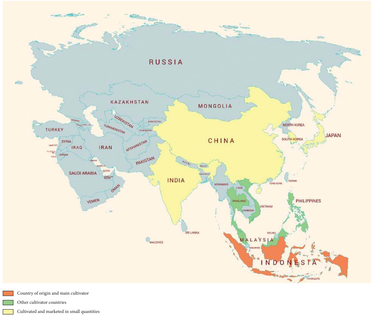
FIGURE 2: Geographic distribution of Curcuma xanthorrhiza Roxb.