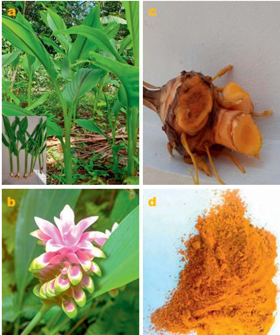
FIGURE 1: Curcuma xanthorrhiza Roxb. (a) Aerial parts of the plant. (b) Flower. (c) Rhizome. (d) Rhizome powder.

hemorrhoid, constipation, and other digestive system problems are related to its antimicrobial activity (Table 2). The efficacy of C. xanthorrhiza to treat arthritis is probably related to its anti-inflammatory ability [14, 52]. C. xanthorrhiza usage to treat some disorders related to metabolic syndrome such as hypotriglyceridemia has also been scientifically examined [53, 54]. The use of C. xanthorrhiza to cure liver illness has also been tested scientifically [15, 18, 55, 56]. We believe that the traditional efficacy of C. xanthorrhiza is mostly related to its antimicrobial, antioxidant, and anti-inflammatory capability. Moreover, the efficacy of C. xanthorrhiza for malaria treatment has been evaluated preliminarily by heme polymerization inhibition [57]. Surely, this antimalaria activity of C. xanthorrhiza has to be evaluated more comprehensively. On the other hand, we have not found trusted scientific proof indicating C. xanthorrhiza effectiveness for the treatment of gynecology-related disorders such as vaginal discharge, postpartum medicine, and postdelivery