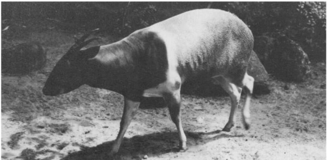
Jentink's duiker.

As part of the Conservation Society of Sierra Leone's faunal survey, we conducted interviews with hunters in the southern part of the Freetown