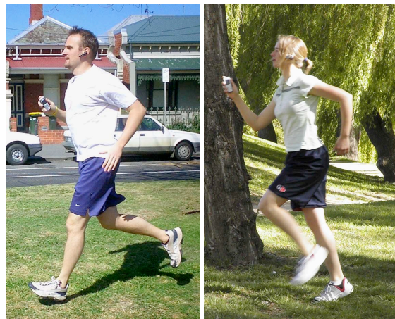
Figure 1. Can a mobile create a shared, jogging experience?

the same duration and who can meet at the same location. One possible solution for this challenge is to increase the number of available and compatible jogging partners by enabling Jogging the Distance : jogging with non-located partners (Figure 1). Jogging the Distance has the potential to enable people to jog with their friends who run at differing paces or live far away.