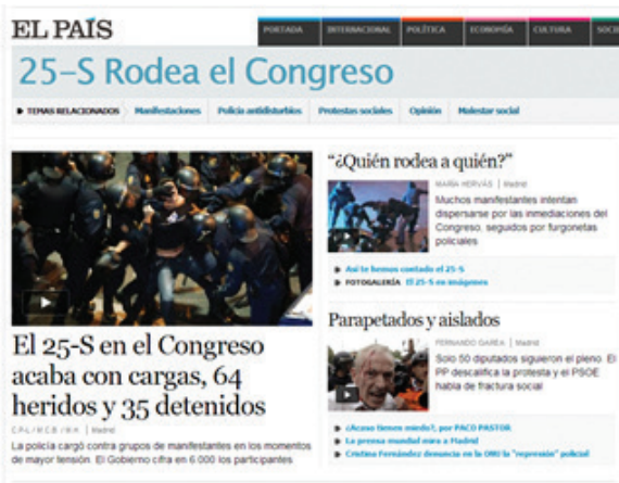
Figure 2 Front page the section created to cover the events of “25S” on the website of the newspaper El País .

In the case about to be described, there are many manifestations of this movement. On September 25, 2012, thousands of people took to the streets of Madrid, in Spain, during the “25S”, a protest organized by the Indignados , one of the groups that adhered to movements around the world, supporting the demands of the minorities, better wealth distribution, and alternate models of social organization, especially in Europe and in the United States 4 ; their main claim is real – or direct – democracy. This time they were also calling for a new constituent assembly; they occupied a square in front of the Spanish Congress.