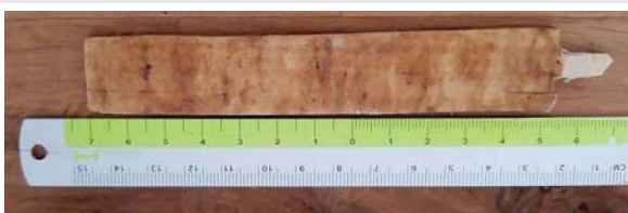
Figure 1: Kambo stick containing dried secretion of the frog.

In the secretion of the frog at least 3 bioactive peptides have been isolated, with clear painkilling properties. Two of these peptides activate the morphine-related opioid receptor, MOR, and one has high affinity for the delta-opioid receptor, DOR. In animal models, all these 3 molecules have analgesic properties; dermorphin and cerulein have also been tested in humans,