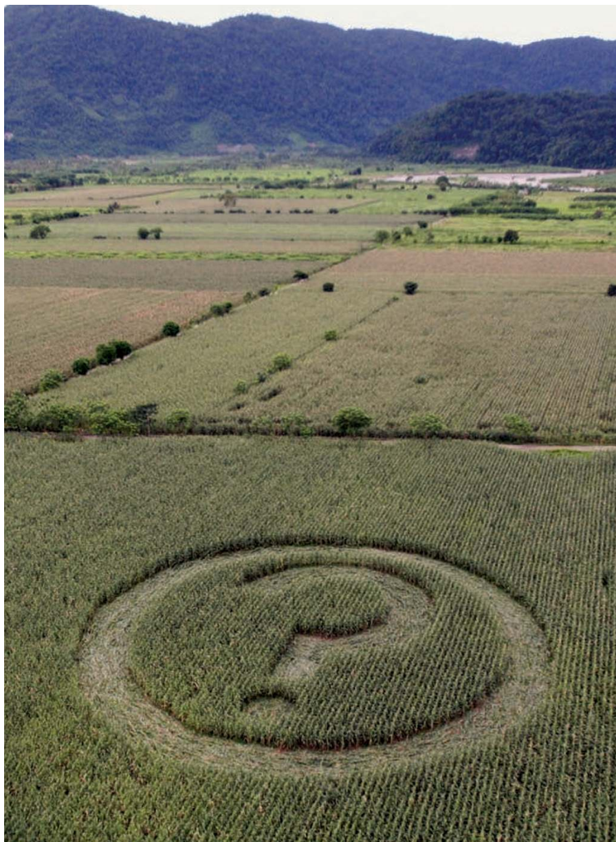
A UK crop circle, created by activists to signify uncertainty over where genetic contamination can occur.

OBITUARY Brian Marsden, keeper of comets, remembered p.1042