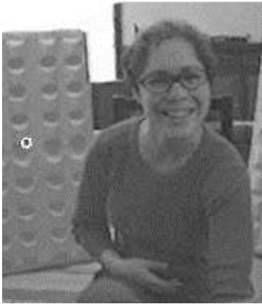
Figure 3. Avoidance fixation.