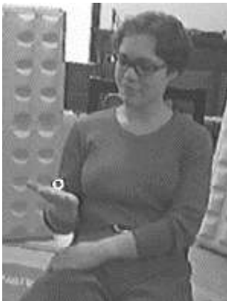
Figure 5. A speaker's auto-fixation followed by a listener-fixation of the same gesture.