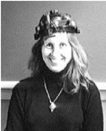
Figure 1. The SMI iView headset.