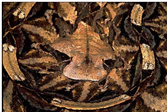
Figure 3 Bitis gabonica .

Snakes are called 'nzoka' and 'thuol' in the Kamba and Luo language respectively. In Kambaland, a number of venomous species were identified: "nzoka ya kiko" or Naja melanoleuca (Fig. 2); the very fierce "yaitha" or Dendroaspis polylepis and 'kimbuva' or Bitis spp. (Fig. 3) the puff adders. With exception of the spitting cobra, these snakes typically deliver venom through two hollow teeth called fangs; the venom is called 'kiri' in Dholuo and "sumu" in Kikamba . Spitting cobras are notable for visiting settled areas and are reputed to spit venom toward enemies up to 2.5 m away. There was concurrence among the informants that some snake bite cases were caused by malevolent persons.