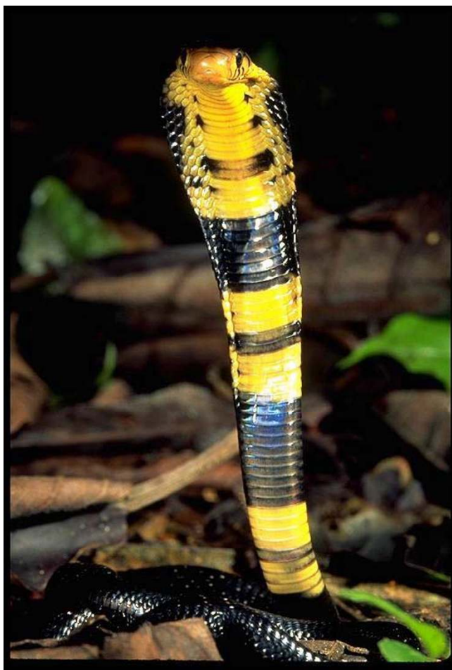
Figure 2 Naja melanoleuca.

education. The information in table 1 is for the total 212 respondents interviewed. In general the more educated respondents had less knowledge on these remedies.