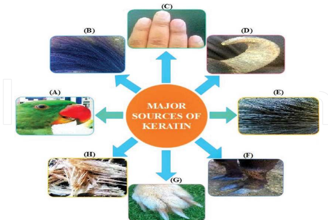
Figure 1. Major sources of keratin protein (A) Bird's beak; (B) animal hair; (C) human nail; (D) horn; (E) human hair; (F) hoof; (G) wool; (H) chicken feather: the hosts for these sources include human, bird and animal.

Keratin protein derives from living organism or from their body parts after death. The richest sources of keratin are feathers, wool, hair, hoof, scales and stratum corneum ( Figure 1 ) [27]. Hair is the byproduct from tanneries during the haircut process [45]. Keratin protein is present in the human hair and offers flexibility, strength and durability to the hair in the form of different conformations [46, 47]. The bird's feather is made up of over 90% of keratin protein and produced as waste by poultry-processing industries [48].