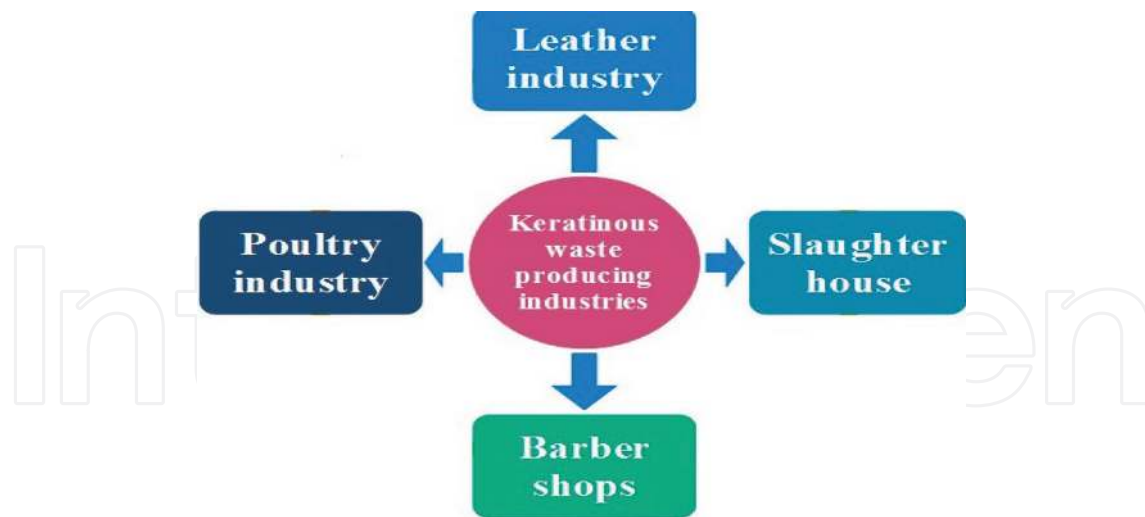
Figure 2. Major keratin waste producing industries.

difficult. Decomposition methods like incineration are employed [20], but these procedures are environment-polluting and pose risk to the environment [66].