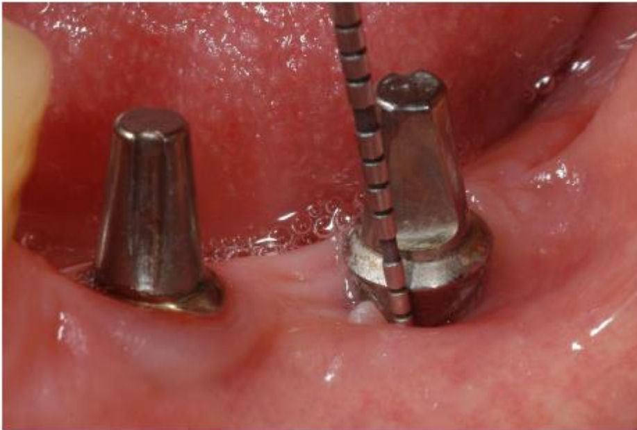
Fig. 2. At 2-year follow-up: patient reports discomfort when performing plaque control around distal implant. Soft-tissue graft is scheduled to increase tissue thickness