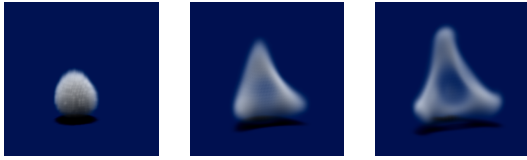
Figure 7: A ball of smoke splits in three directions.

control (20 wind forces) to the first time step of the simulation, we are essentially solving for the initial velocity grid and letting the rest of the simulation proceed unhindered. The optimization took 2 hours to run on a 2Ghz Pentium 4, though we have not made significant efforts at efficiency and believe all the examples could be achieved substantially more quickly, for example, by leveraging the parallelism described in Section 8.2.