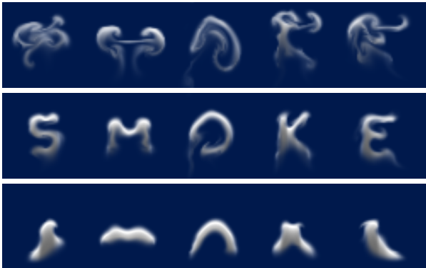
Figure 8: Smoke rising to form the letters “SMOKE.”

In this paper, we have presented a novel technique for controlling smoke simulations through keyframing, allowing the user consid-