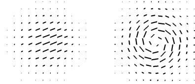
Figure 2: Control forces discretized onto a velocity grid. Wind forces (left), and vortex forces (right).

The above framework is independent of the actual control parameters used in the simulation, and will work so long as the derivatives can be calculated. Here we present two possible types of control forces. The force parameters make up the control vector \mathbf{u} .