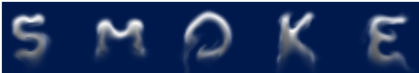
Figure 1: Single frame of a physically-based fluid animation spelling out letters.