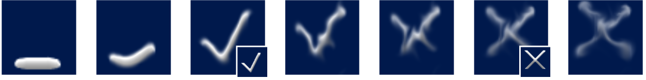
Figure 9: An animation of smoke forming “check” then “x.” The keyframes for this animation are inset.

This implies the following set of derivatives with respect to u_k :