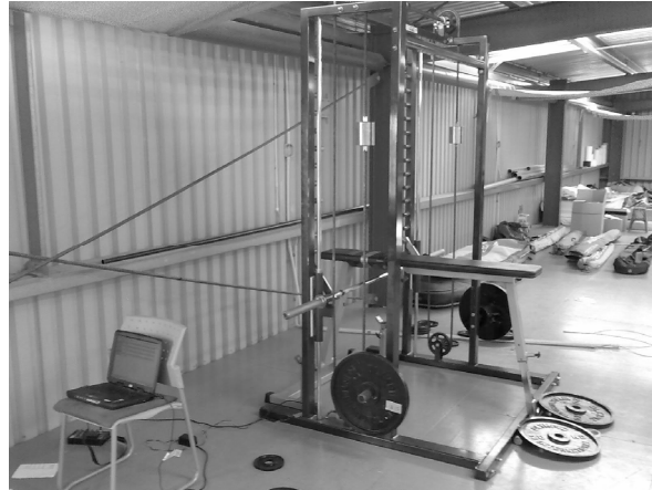
Figure 1: Testing set-up for the power-load spectrum of the bench pull exercise.

Equipment: Testing was performed on a modified Smith machine (Figure 1). A linear transducer (Unimeasure, Oregon) was attached to the bar and measured bar displacement with an accuracy of 0.1 mm. These data were sampled at 500 Hz and relayed to a Labview based acquisition and analysis program.