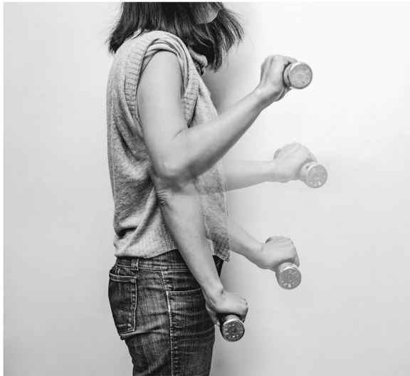
Fig. 3 The pain-1 kg test. During the test, participants lifted the weight while flexing the elbow from 0 to 120 degrees and returned the weight to starting position. The wrist was kept pronated during this process so that the wrist extensor muscles were isometrically contracted to counter gravity throughout the process

and the pressure pain threshold (PPT). When measuring the PFG, the subject stood with the elbow in complete extension and the shoulder and radioulnar joints in neutral rotation. The subject then began to squeeze a dynamometer (JAMAR Plus, Patterson Medical, Canada) with increasing force until he/she felt elbow pain [27]. The PPT (i.e., minimum amount of pressure that triggered pain) was quantified by applying the 1-cm 2 rubber probe tip of a digital algometer (Force Ten FDX Force Gage, Wagner Instruments, USA) to the most palpably tender site over the lateral epicondyle [28]. The PFG and PPT were measured three times and average values used for analysis. An assessor blinded to the treatment assignment performed all measurements before taping (pretest) and 15 min after taping with the tape in situ (posttest). We removed tapes after the posttest. Despite the similar appearances of the KT and ST, participants were asked to wear a long-sleeved shirt to cover the taping so that the assessor was sufficiently blinded to the taping type at the posttest.