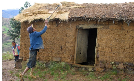
Figure 2 Reparation of roof cover by using woody branches, straw and loam.

dynamic values. They transform over time and thus may vary from one generation to the next due to abrupt or gradual changes in how people use or do not use plants in changing living conditions [10,35]. In the Bolivian highlands and lowlands, rural out-migration to urban centres strongly influences peasants' livelihoods. Young adults in particular migrate to seek better income and access to basic services such as healthcare, education, and infrastructure [36]. These processes can increase the generational differences in plant-related knowledge and valuation, and can also cause loss of traditional knowledge among the youth [37,38].