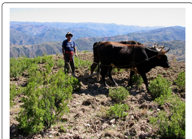
Figure 6 Importance of B. dracunculifolia for the restoration of soil fertility in fallow land.

Local people tended to give higher cultural importance to trees (e.g. S. molle ) than shrubs (e.g. L. graveolens ), as demonstrated by both ethnobotanical indices used (Composite S, CI) (Figure 5). This is supported by another study carried out in the same area [4] that revealed that sociocultural plant values increased with plant height and timber availability. This may be explained by the scarcity of timber needed for fuelwood and construction in the region. However, some frequently-growing shrubs such as B. dracunculifolia were also intensively used as fuelwood, for livestock fences, and in restoration of soil fertility in fallow land (Figure 6), and were thus highly valued by local people. This suggests that cultural importance and use-values of woody plants may not depend on their life-form only, but rather on their availability and accessibility (see also [4,8,9,46], especially in the case of frequently-used fuel plants [47]. Furthermore, plants' specific attributes (e.g. hard wood, tasty fruits) that exclusively meet important subsistence needs increase their cultural importance [10]. S. molle ,