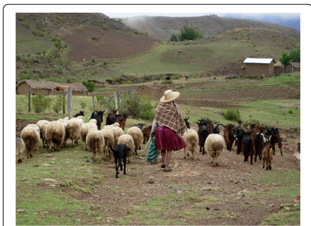
Figure 1 Livestock rearing.