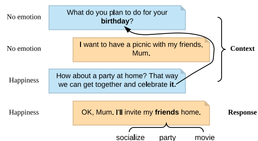
Figure 1: An example conversation with annotated labels from the DailyDialog dataset (Li et al., 2017). By referring to the context, “it” in the third utterance is linked to “birthday” in the first utterance. By leveraging an external knowledge base, the meaning of “friends” in the fourth utterance is enriched by associated knowledge entities, namely “socialize”, “party”, and “movie”. Thus, the implicit “happiness” emotion in the fourth utterance can be inferred more easily via its enriched meaning.

Emotions are “generated states in humans that reflect evaluative judgments of the environment, the self and other social agents” (Hudlicka, 2011). Messages in human communications inherently convey emotions. With the prevalence of social media platforms such as Facebook Messenger, as well as conversational agents such as Amazon Alexa, there is an emerging need for machines to understand human emotions in natural conversations. This work addresses the task of detecting emotions (e.g., happy, sad, angry, etc.) in textual conversations, where the emotion of an utterance is detected in the conversational context. Being able to effectively detect emotions in conversations leads to a wide range of applications ranging from opinion mining in social media platforms